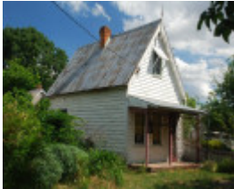
RESIDENCE SOHE 2008