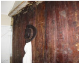
26 Finch slab wall of kitchen