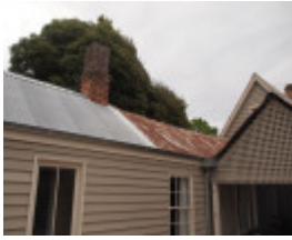
H0352 RESIDENCE LHA 2015 4.JPG