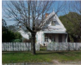
1 residence 26 finch street beechworth