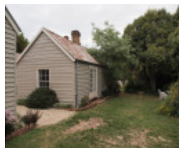
H0352 RESIDENCE LHA 2015 3.JPG