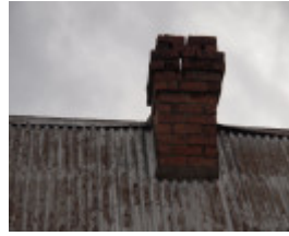
H0352 RESIDENCE LHA 2015 5.JPG