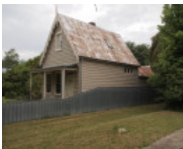
H0352 RESIDENCE LHA 2015 1.JPG