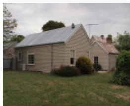
H0352 RESIDENCE LHA 2015 2.JPG