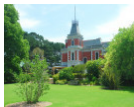
COOLART SOHE 2008