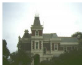
1 coolart lord somers road somers front view jan1994