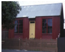
1 iron house coventry street south melb front view