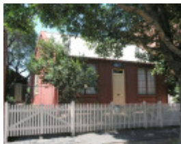
IRON HOUSE SOHE 2008