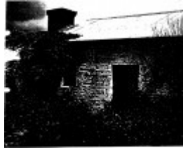
268 - Sweeneys Cottage Eltham 05 - 1949? photograph of a stone cottage stated to have been part of Sweeney's homestead - Shire of Eltham Heritage Study 1992