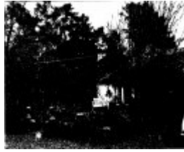
268 - Sweeneys Cottage Eltham 11 - Shire of Eltham Heritage Study 1992