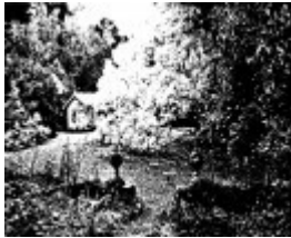
268 - Sweeneys Cottage Eltham 18 - Shire of Eltham Heritage Study 1992