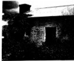
268 - Sweeneys Cottage Eltham 05 - 1949? photograph of a stone cottage stated to have been part of Sweeney's homestead - Shire of Eltham Heritage Study 1992