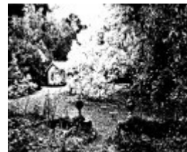
268 - Sweeneys Cottage Eltham 18 - Shire of Eltham Heritage Study 1992