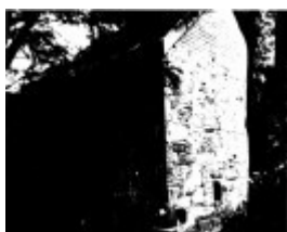
268 - Sweeneys Cottage Eltham 07 - Shire of Eltham Heritage Study 1992