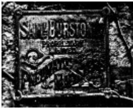
268 - Sweeneys Cottage Eltham 19 - Shire of Eltham Heritage Study 1992