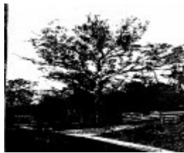
268 - Sweeneys Cottage Eltham 17 - 100 year old apple tree - Shire of Eltham Heritage Study 1992