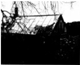
268 - Sweeneys Cottage Eltham 13 - Shire of Eltham Heritage Study 1992