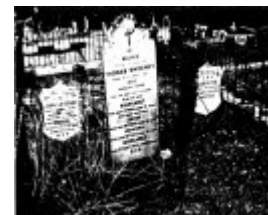
268 - Sweeneys Cottage Eltham 09 - Shire of Eltham Heritage Study 1992