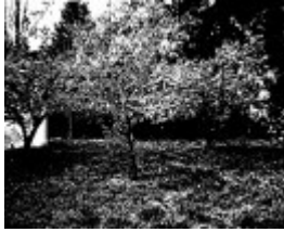
268 - Sweeneys Cottage Eltham 15 - Apple Orchard Trees - Shire of Eltham Heritage Study 1992