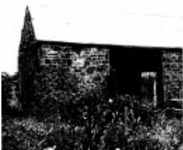
268 - Sweeneys Cottage Eltham 04 - 1949? photograph of the barn - Shire of Eltham Heritage Study 1992