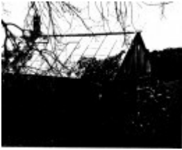
268 - Sweeneys Cottage Eltham 13 - Shire of Eltham Heritage Study 1992