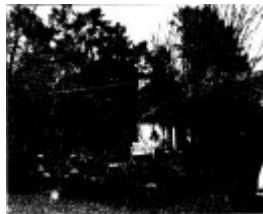
268 - Sweeneys Cottage Eltham 11 - Shire of Eltham Heritage Study 1992