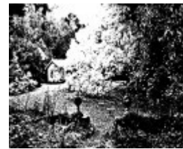
268 - Sweeneys Cottage Eltham 18 - Shire of Eltham Heritage Study 1992