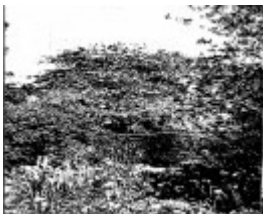
268 - Sweeneys Cottage Eltham 16 - 100 year old pear tree - Shire of Eltham Heritage Study 1992