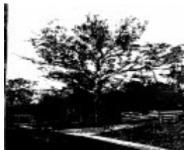
268 - Sweeneys Cottage Eltham 17 - 100 year old apple tree - Shire of Eltham Heritage Study 1992