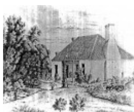
268 - Sweeneys Cottage Eltham 03 - Drawing of Sweeney's Cottage - Origins unknown - Shire of Eltham Heritage Study 1992