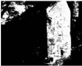
268 - Sweeneys Cottage Eltham 07 - Shire of Eltham Heritage Study 1992