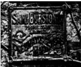
268 - Sweeneys Cottage Eltham 19 - Shire of Eltham Heritage Study 1992