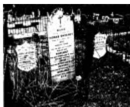
268 - Sweeneys Cottage Eltham 09 - Shire of Eltham Heritage Study 1992