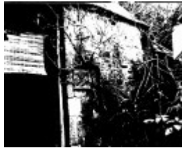
268 - Sweeneys Cottage Eltham 08 - Shire of Eltham Heritage Study 1992