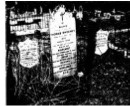
268 - Sweeneys Cottage Eltham 09 - Shire of Eltham Heritage Study 1992