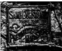
268 - Sweeneys Cottage Eltham 19 - Shire of Eltham Heritage Study 1992