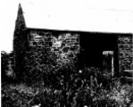
268 - Sweeneys Cottage Eltham 04 - 1949? photograph of the barn - Shire of Eltham Heritage Study 1992