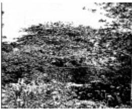
268 - Sweeneys Cottage Eltham 16 - 100 year old pear tree - Shire of Eltham Heritage Study 1992