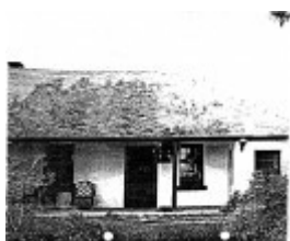
268 - Sweeneys Cottage Eltham - Shire of Eltham Heritage Study 1992