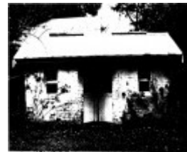
268 - Sweeneys Cottage Eltham 12 - Shire of Eltham Heritage Study 1992