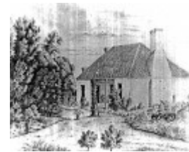
268 - Sweeneys Cottage Eltham 03 - Drawing of Sweeney's Cottage - Origins unknown - Shire of Eltham Heritage Study 1992