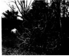
268 - Sweeneys Cottage Eltham 14 - Shire of Eltham Heritage Study 1992