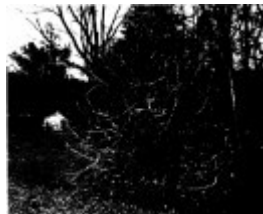
268 - Sweeneys Cottage Eltham 14 - Shire of Eltham Heritage Study 1992