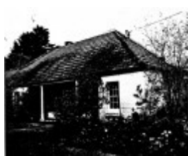
268 - Sweeneys Cottage Eltham 02 - Shire of Eltham Heritage Study 1992