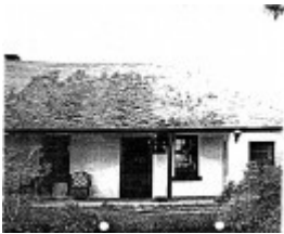
268 - Sweeneys Cottage Eltham - Shire of Eltham Heritage Study 1992