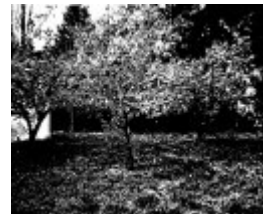
268 - Sweeneys Cottage Eltham 15 - Apple Orchard Trees - Shire of Eltham Heritage Study 1992