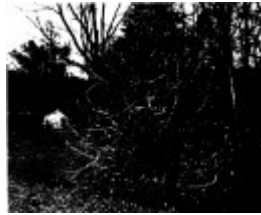
268 - Sweeneys Cottage Eltham 14 - Shire of Eltham Heritage Study 1992