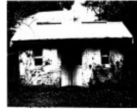
268 - Sweeneys Cottage Eltham 12 - Shire of Eltham Heritage Study 1992