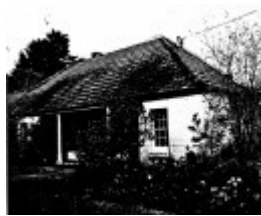
268 - Sweeneys Cottage Eltham 02 - Shire of Eltham Heritage Study 1992