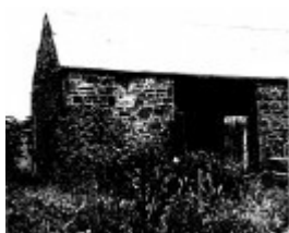
268 - Sweeneys Cottage Eltham 04 - 1949? photograph of the barn - Shire of Eltham Heritage Study 1992