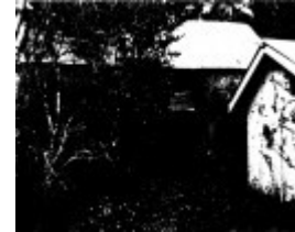
268 - Sweeneys Cottage Eltham 06 - Shire of Eltham Heritage Study 1992