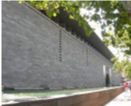
NATIONAL GALLERY OF VICTORIA SOHE 2008