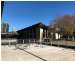
2021 NGV Former Art School