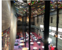
2021 NGV Great Hall