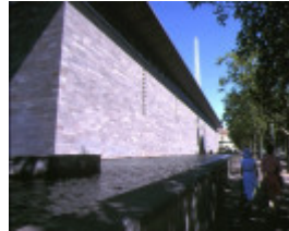
1 national gallery of victoria st kilda road melbourne front view