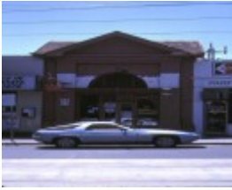
1 former south yarra railway station toorak road south yarra front view