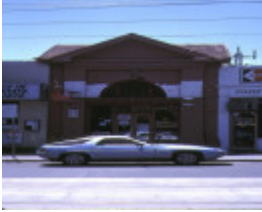
1 former south yarra railway station toorak road south yarra front view