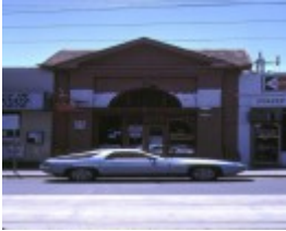
1 former south yarra railway station toorak road south yarra front view