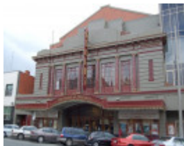
Regent Theatre Ballarat front elevation 2009