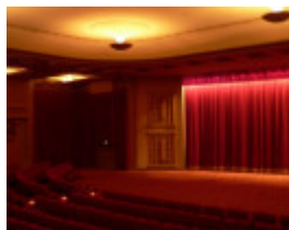
Regent Ballarat auditorium detail 2009