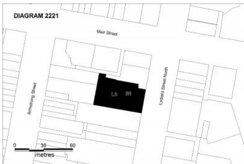
Regent Ballarat Plan