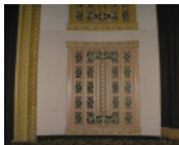
Regent Ballarat panel detail in auditorium 2009