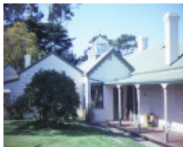
1 strathfieldsaye homestead perry bridge stratford rear view of homestead sep1982