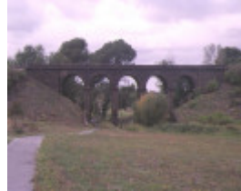
1 rail bridge over kismet creek sunbury side view jun1984