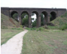
RAIL BRIDGE SOHE 2008