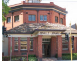
BRAILLE LIBRARY AND HALL SOHE 2008