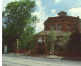
1 braille library 31-51 commercial rd sth yarra oct 2000 jbo front