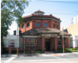
BRAILLE LIBRARY AND HALL SOHE 2008