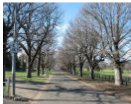
Yarra Park avenue of elms across north of site July 2009