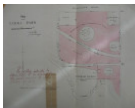
plan of Yarra Park 1867 from DSE files