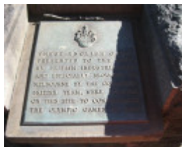
Yarra Park commemorative plaque for avenue of oaks. July 2009