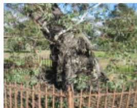
Yarra Park scarred tree 2. July 2009