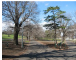
Yarra Park view towards Punt Road from north west