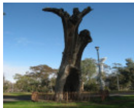
Yarra Park scarred tree 1. July 2009