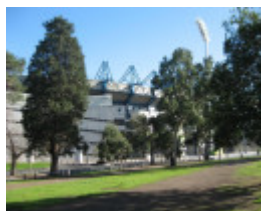
Yarra Park view towards MCG. July 2009