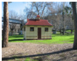
Yarra Park Cabman's shelter. July 2009