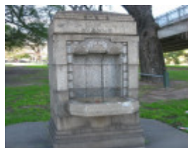
Yarra Park drinking fountain July 2009