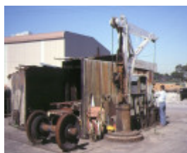
Former Railway Workshops Champion Road Newport Hydraulic Crane