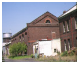
Former Railway Workshops Champion Road Newport Central Store Feb 1994