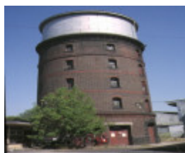
Former Railway Workshops Champion Road Newport Water Tower Feb 1994