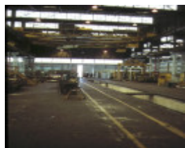
Former Railway Workshops Champion Road Newport Workshop Interior