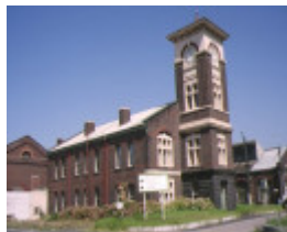
Former Railway Workshops Champion Road Newport Central Offices & Clock Tower