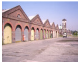
1 former railway workshops champion road newport east block of workshops feb1994