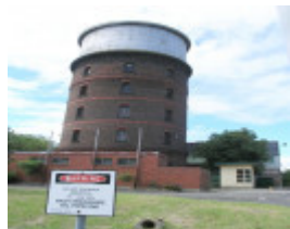
FORMER NEWPORT RAILWAY WORKSHOPS SOHE 2008