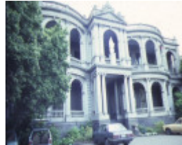
1 mandeville hall mandeville crescent toorak front view dec1985