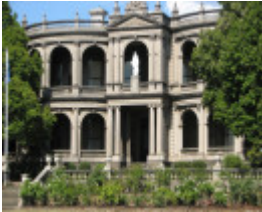
MANDEVILLE HALL SOHE 2008