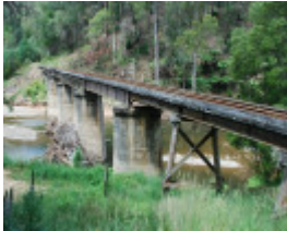
RAIL BRIDGE SOHE 2008