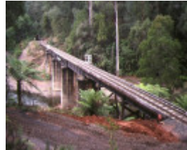
1 rail bridge thomson river walhalla end view apr1995