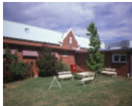
ovens & murray hospital for the aged warners road beechworth side elevation dec1984