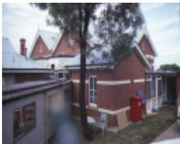
ovens & murray hospital for the aged warners road beechworth rear view dec1984