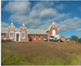
Main facade in July 2018