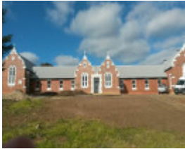
Main facade in July 2018