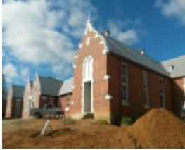
Main facade in July 2018