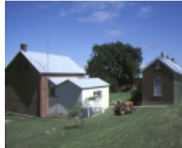
ovens & murray hospital for the aged warners road beechworth rear building