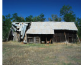
BONTHARAMBO HOMESTEAD SOHE 2008