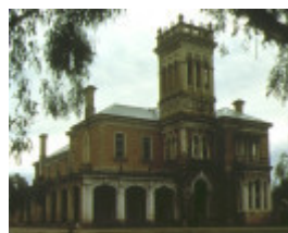
h00359 bontharambo homestead off boorhaman rd wangeratta front view homestead jun1978