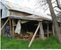
Bontharambo homestead stables 2008