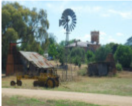
BONTHARAMBO HOMESTEAD SOHE 2008