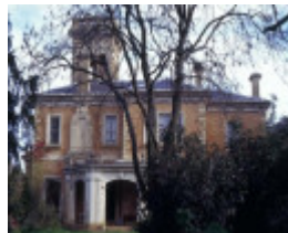
bontharambo homestead boorhaman road wangeratta garden she project 2003