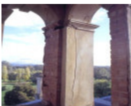
bontharambo homestead boorhaman road wangeratta view from tower she project 2003