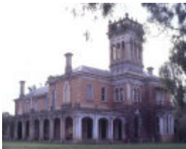
h00359 1 bontharambo homestead boorhaman road wangeratta south view she project 2003