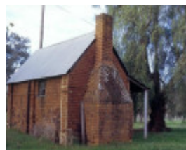
bontharambo homestead boorhaman road wangeratta the gardeners cottage she project 2003