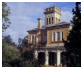
bontharambo homestead boorhaman road wangeratta view from garden she project 2003