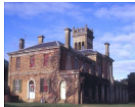
bontharambo homestead boorhaman road wangeratta back view of homestead she project 2003