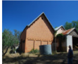
BONTHARAMBO HOMESTEAD SOHE 2008