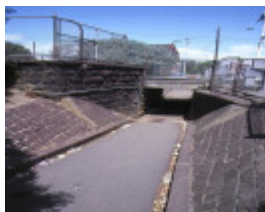
former albert park railway station complex ferrars street albert park underpass nov1986