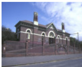
former albert park railway station complex ferrars street albert park front elevation nov1986