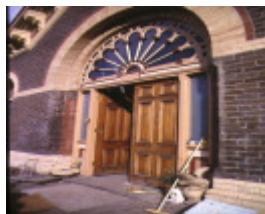
former albert park railway station complex ferrars street albert park front entrance jun1998