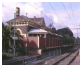
former albert park railway station complex ferrars street albert park platform side jun1998