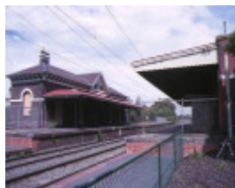
former albert park railway station complex ferrars street albert park platform view feb1989