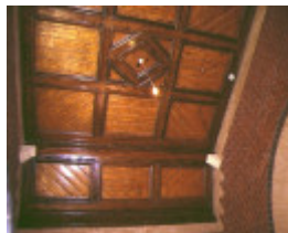
former albert park railway station complex ferrars street albert park ceiling detail jun1998