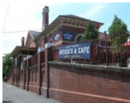
ALBERT PARK RAILWAY STATION COMPLEX SOHE 2008