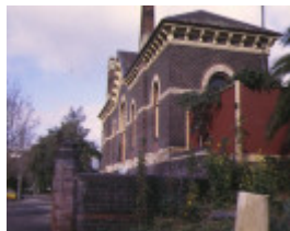
1 former albert park railway station complex ferrars street albert park front elevation jun1998