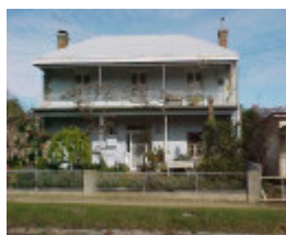
1 bellevue 9 williams street beechworth