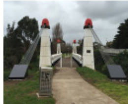
After Photograph - Reference F3855 2016