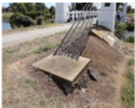
Before Photographs - Reference F3855 2014