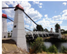
Before Photographs - Reference F3855 2014