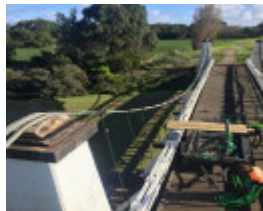
During Photograph - Reference F3855 2014