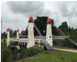
After Photograph - Reference F3855 2016