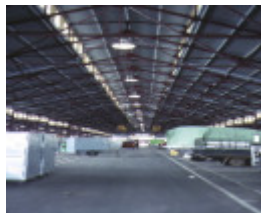
queen victoria market victoria street melbourne interior market shed roof detail