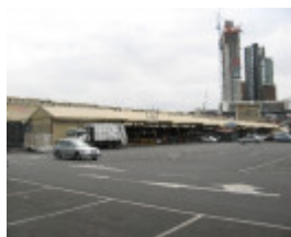
Queen Vic Market 6.jpg