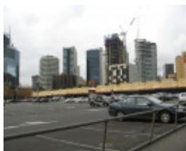
Queen Vic Market 5.jpg