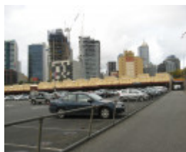
Queen Vic Market 4.jpg