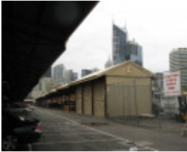
Queen Vic Market 1.jpg