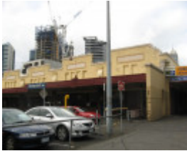
Queen Vic Market 8.jpg