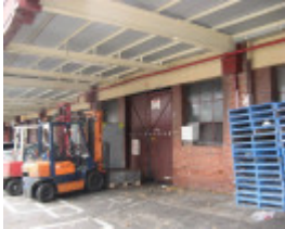
Queen Vic Market 11.jpg