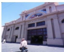
queen victoria market victoria street melbourne front view of meat market & food hall