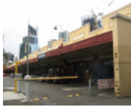
Queen Vic Market 9.jpg