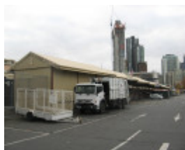
Queen Vic Market 3.jpg