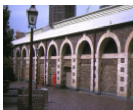
queen victoria market victoria street melbourne side view meat & fish market