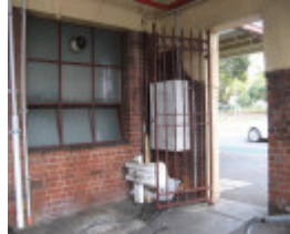
Queen Vic Market 13.jpg