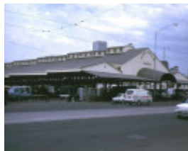
1 queen victoria market victoria street melbourne front view market sheds