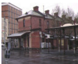
queen victoria market victoria street melbourne peel & victoria street corner