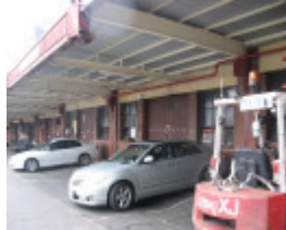
Queen Vic Market 12.jpg