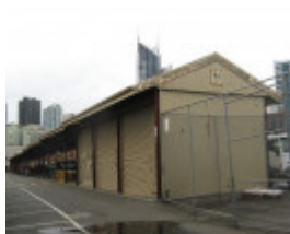
Queen Vic Market 2.jpg