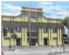
Queen Victoria Market SOHE 2008