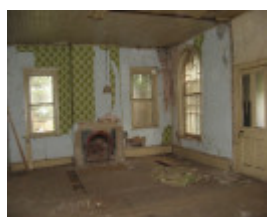
121693_former survey office_Helenslee_Heathcote_A (1).jpg