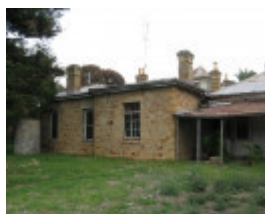
121693_former survey office_Helenslee_Heathcote_A (1).jpg