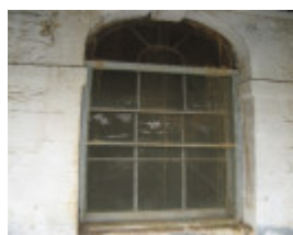
121693_former survey office_Helenslee_Heathcote_A (1).jpg