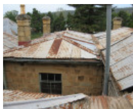
121693_former survey office_Helenslee_Heathcote_A (1).jpg