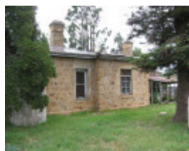
121693_former survey office_Helenslee_Heathcote_A (10).jpg