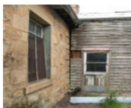
121693_former survey office_Helenslee_Heathcote_A (1).jpg