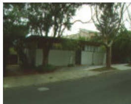
H01963 roy grounds house hill street facade aug01