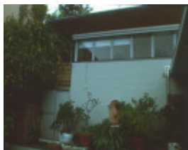
H01963 roy grounds house rear view aug01