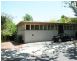
GROUNDS HOUSE SOHE 2008