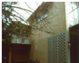
H01963 roy grounds house flats aug01