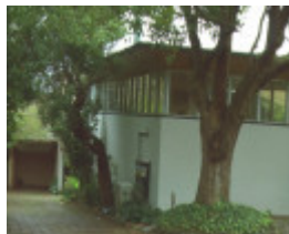
H01963 roy grounds house driveway aug01