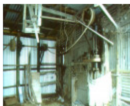
H01965 stonemasons yard kyneton jenny lind aug01