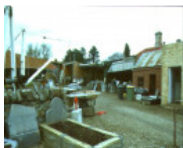
H01965 stonemasons yard kyneton aug01