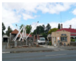
STONEMASONS YARD SOHE 2008