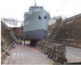
ALFRED GRAVING DOCK SOHE 2008