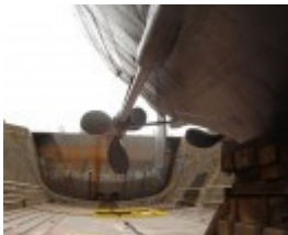
ALFRED GRAVING DOCK SOHE 2008