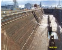
h00697 alfred graving dock williamstown dockyard williamstown side view she project 2004