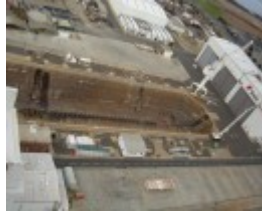
ALFRED GRAVING DOCK SOHE 2008