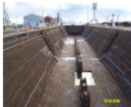
h00697 1 alfred graving dock williamstown dockyard williamstown wide view she project 2004