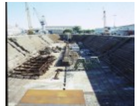
h00697 alfred graving dock williamstown dockyard williamstown front view