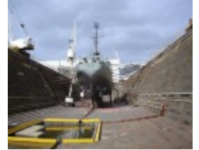
ALFRED GRAVING DOCK SOHE