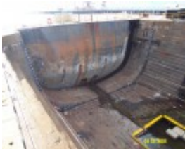
h00697 alfred graving dock williamstown dockyard williamstown close up she project