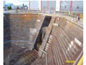
h00697 alfred graving dock williamstown dockyard williamstown steps she