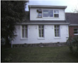
St Giles Church Gheringhap Street Geelong Former School Masters Residence Jul 1985