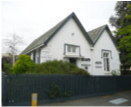
FORMER ST GILES CHURCH AND FREE CHURCH SCHOOL SOHE 2008