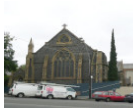
FORMER ST GILES CHURCH AND FREE CHURCH SCHOOL SOHE 2008