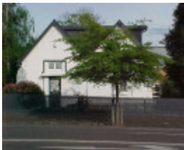
H00633 st giles geelong masters residence oct01