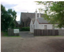
H00633 st giles church gheringhap street geelong rear of school oct01