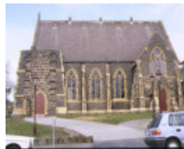
St Giles Church Geelong Church Front View