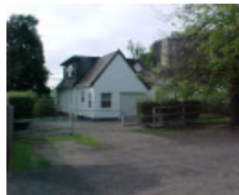
H00633 st giles church gheringhap street geelong rear of masters residence oct01