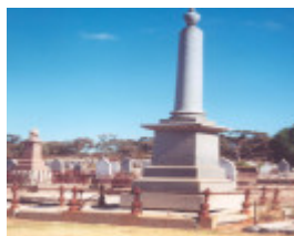
h00798 bendigo cemetery mackay monument