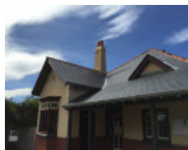
After Photographs - Reference F3843 2016