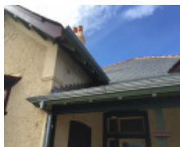
After Photographs - Reference F3843 2016