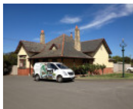
Before Photographs - Reference F3843 2014