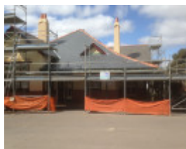
During Photographs - Reference F3843 2015