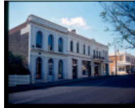
h02039 kyneton piper street shops exterior