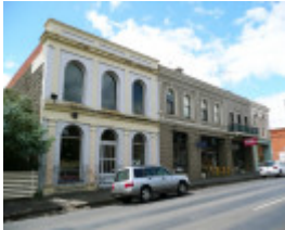
SHOPS SOHE 2008