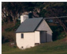
H02030 point nepean shepherds hut