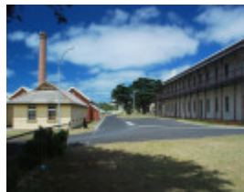
POINT NEPEAN DEFENCE AND QUARANTINE PRECINCT SOHE 2008