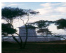
H02030 point nepean heatons monument