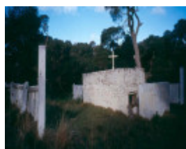
H02030 point nepean crematorium