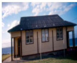
H02030 point nepean showerblock