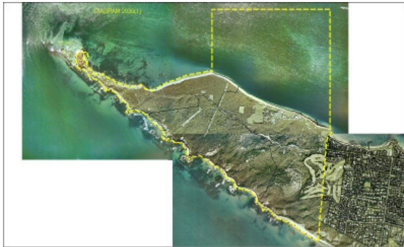
Point Nepean Plan