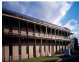
H02030 1point nepean hospital