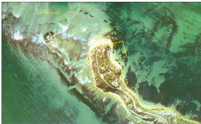
Point Nepean Plan