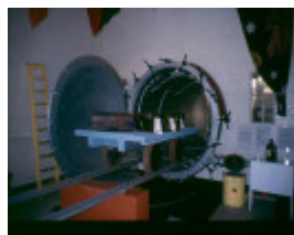
H02030 point nepean quarantine interior