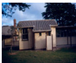
H02030 point nepean isolation hospital