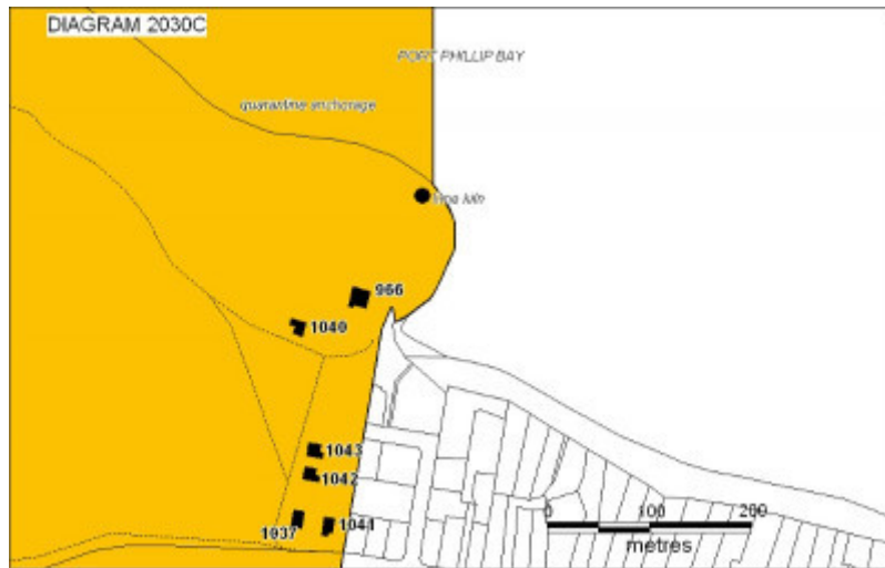
h02030 portseac plan