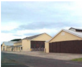
H01969 pt cook south tarmac1 aug02 pm1