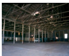
H01969 pt cook inside seaplane hangar aug02 pm1