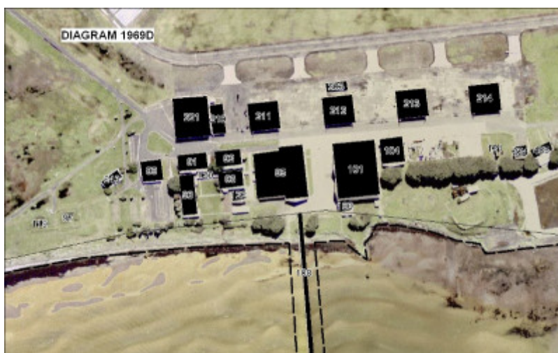
h01969 diagram 1969d