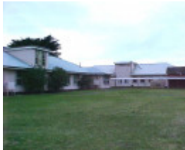
H01969 pt cook school of languages aug02 pm1