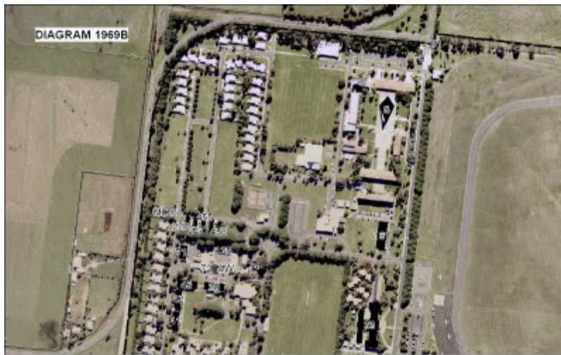
h01969 diagram 1969b