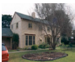
H01969 pt cook lukis house aug02 pm1