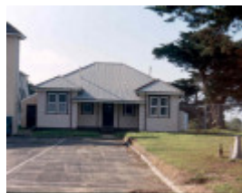
H01969 pt cook bldg100 aug02 pm1