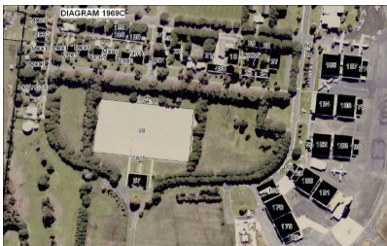
h01969 diagram 1969c