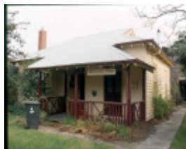
H01969 pt cook caretakers cottage aug02 pm1