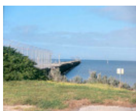
H01969 pt cook jetty aug02 pm1