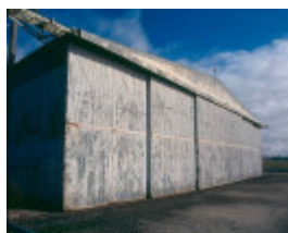
H01969 pt cook bellman hangar aug02 pm1