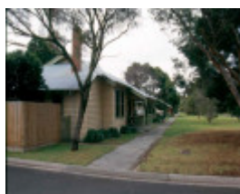
H01969 pt cook harmony row aug02 pm1