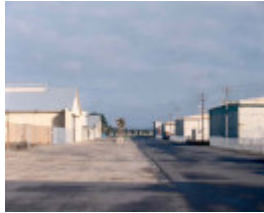
H01969 pt cook south tarmac aug02 pm1