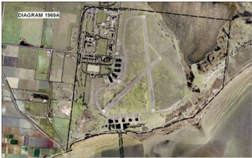
h01969 diagram 1969a