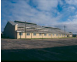
H01969 pt cook waterplane hangar aug02 pm1