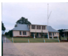
H01969 pt cook headquarters aug02 pm1