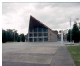
H01969 pt cook chapel aug02 pm1