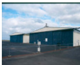
H01969 pt cook bellmans aug02 pm1