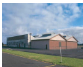
H01969 pt cook hangar store aug02 pm1