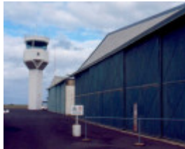
H01969 pt cook tower aug02 pm1