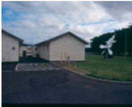
H01969 pt cook ww2 huts aug02 pm1