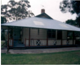
H01969 pt cook married quarters aug02 pm1