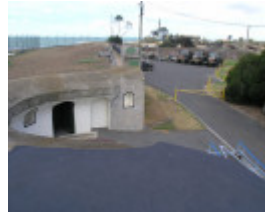
FORT GELLIBRAND SOHE 2008