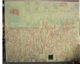
Haring Mural after conservation