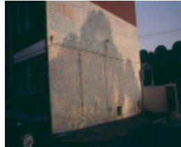
h02055 mural 2