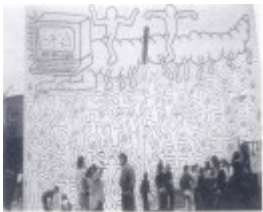
Keith Haring Mural Collingwood Making