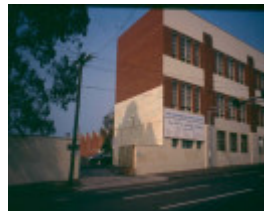
h02055 johnston st view