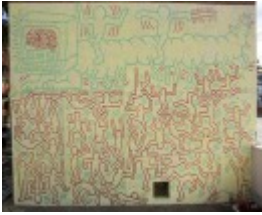
Haring Mural after conservation