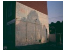
h02055 mural 3