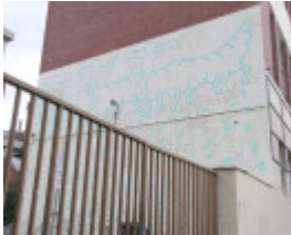
KEITH HARING MURAL SOHE 2008