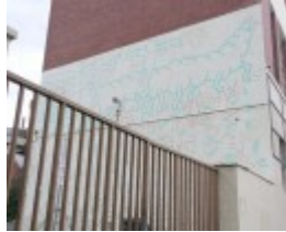
KEITH HARING MURAL SOHE 2008