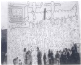
Keith Haring Mural Collingwood Making