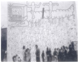
Keith Haring Mural Collingwood Making