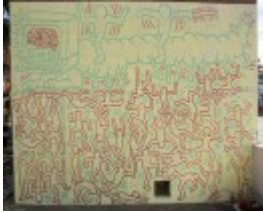
Haring Mural after conservation- Image: Courtesy Arts Vic