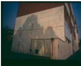
h02055 haring mural 1