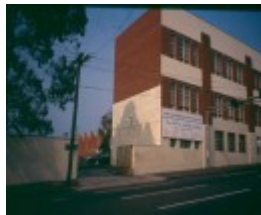
h02055 johnston st view