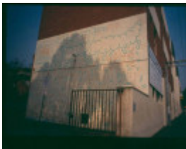
h02055 haring mural 1