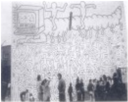
Keith Haring Mural Collingwood Making