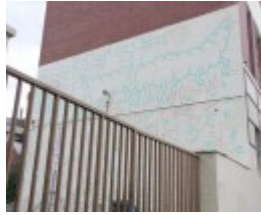
KEITH HARING MURAL SOHE 2008