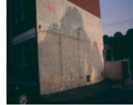
h02055 mural 2