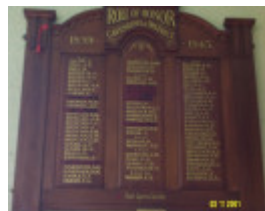
23634 Cavendish Memorial Hall 0139