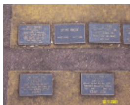
23634 Cavendish Memorial Park 0128