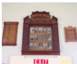
23634 Cavendish Memorial Hall 0137