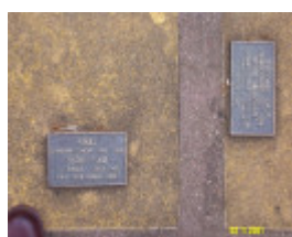
23634 Cavendish Memorial Park 0131