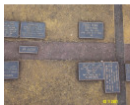
23634 Cavendish Memorial Park 0129