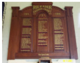
23634 Cavendish Memorial Hall 0138