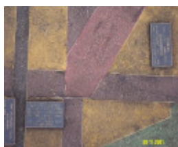
23634 Cavendish Memorial Park 0130