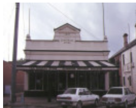
1 purcells general store high street yea front view apr1989