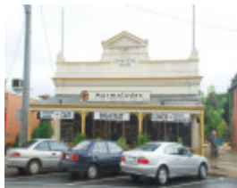
PURCELLS GENERAL STORE SOHE 2008