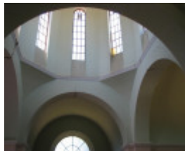
BOX HILL CEMETERY COLUMBARIUM AND MYER MEMORIAL SOHE 2008