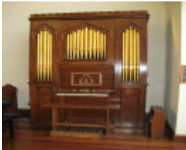
Moyle organ St Linus Merlynston_front_11 Feb 08