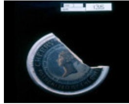
h01889 gisborne mains artefacts cosmetic lid