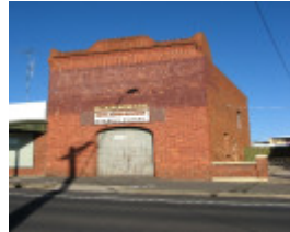
Maryborough cab building_KJ_8 Nov 07