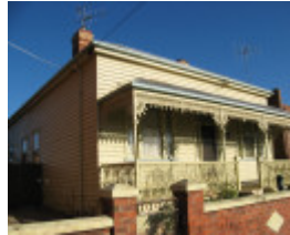
Maryborough cab building residence_KJ_8 Nov 07