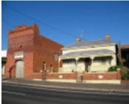
Maryborough cab building & house_KJ_8 Nov 07