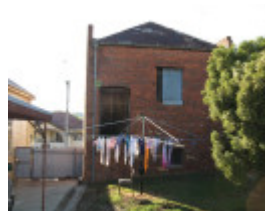
Maryborough cab building rear_KJ_8 Nov 07