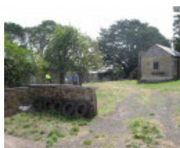
Burgers Penshurst_sitew with stable on left main cottage right_KJ _ apr 09