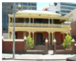
MARY MACKILLOP HOUSE SOHE 2008