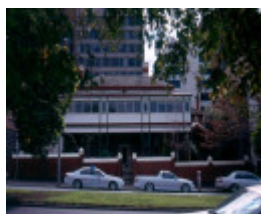
h01062 mary mckillop 1902 longshot