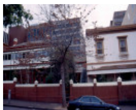
h01062 1 mary mckillop exterior sept04