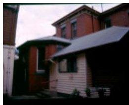
h01062 mary mckillop 1902 east chapel