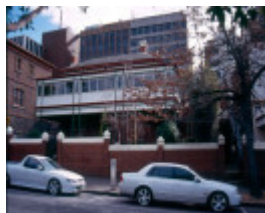
h01062 mary mckillop 1902 exterior