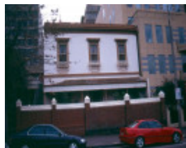
h01062 mary mckillop 1872 front