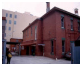
h01062 mary mckillop 1902 rear2