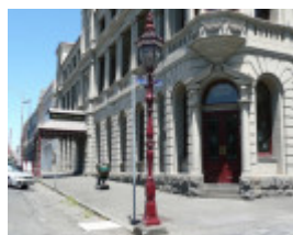
GAS LAMPS SOHE 2008