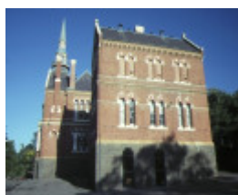
camp hill school 1976 bendigo side elevation jul1984