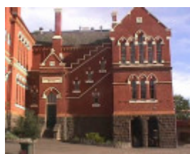
h01642 camp hill central school no 1976 gaol road rosalind park bendigo close up she project 2004