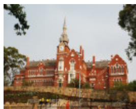
CAMP HILL CENTRAL SCHOOL NO.1976 SOHE 2008