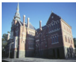
1 camp hill school 1976 bendigo front elevation jul1984