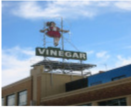
h02083 1 skipping girl 001 may2005 mz