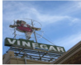
h02083 skipping girl 002 may2005 mz