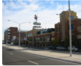
h02083 skipping girl 004 may2005 mz