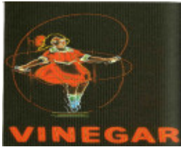
h02083 skipping girl illuminated