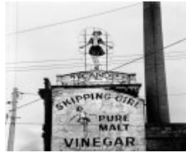
h02083 skipping girl original 02