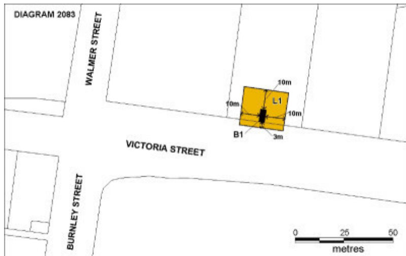
h02083 skipping girl plan june2005 mz