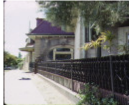
coolock house bendigo detail of front entrance & iron fence oct1988