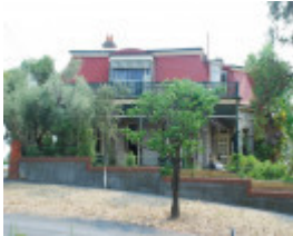
COOLOCK HOUSE SOHE 2008