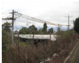
Maribyrnong substation view from above