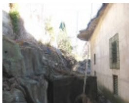
Maribyrnong substation quarry wall at rear