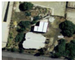
Maribyrnong substation aerial view