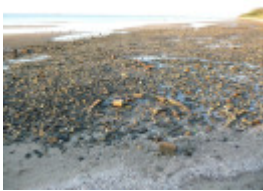
FORMER MINERAL SPRINGS, CLIFTON SPRINGS SOHE 2008