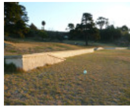
FORMER MINERAL SPRINGS, CLIFTON SPRINGS SOHE 2008