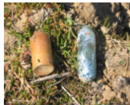
H2088 Clifton Springs Aug 05 artefacts