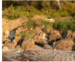
FORMER MINERAL SPRINGS, CLIFTON SPRINGS SOHE 2008