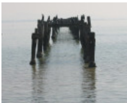
H2088 Clifton Springs Aug 05 long jetty