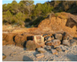
FORMER MINERAL SPRINGS, CLIFTON SPRINGS SOHE 2008