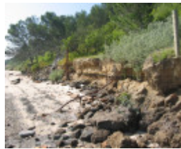
H2088 Clifton Springs Aug 05