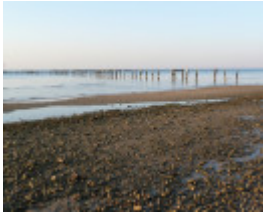
FORMER MINERAL SPRINGS, CLIFTON SPRINGS SOHE 2008