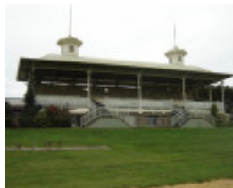
14252 Hamilton racecourse 4Sept06 grandstand7