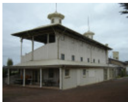
14252 Hamilton racecourse 4Sept06 side rear