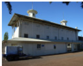
HAMILTON RACECOURSE GRANDSTAND SOHE 2008