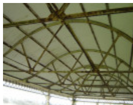
14252 Hamilton racecourse 4Sept06 grandstand roof