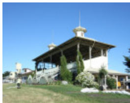
HAMILTON RACECOURSE GRANDSTAND SOHE 2008