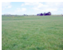
H2107 Herrnhut H2107 ridge and furrows April 2006