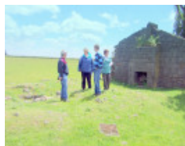
H2107 Herrnhut H2107 Krummnows house ruin April 2006