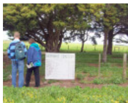
H2107 Herrnhut H2107 cemetery April 2006