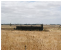
HERRNHUT UTOPIAN COMMUNE SOHE 2008