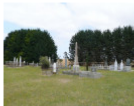
HERRNHUT UTOPIAN COMMUNE SOHE 2008