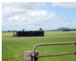
H2107 Herrnhut H2107 general view April 2006