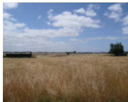
HERRNHUT UTOPIAN COMMUNE SOHE 2008