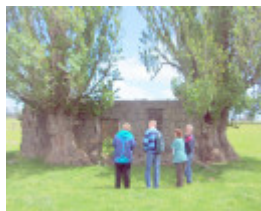
H2107 Herrnhut H2107 Krummnows house ruin b April 2006