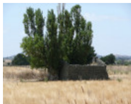
HERRNHUT UTOPIAN COMMUNE SOHE 2008