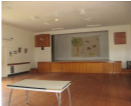
Woodhouse-Nareeb Soldiers Memorial Hall