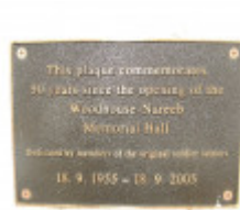
Woodhouse-Nareeb Soldiers Memorial Hall