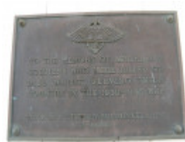
Woodhouse-Nareeb Soldiers Memorial Hall