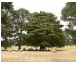
WOODHOUSE-NAREEB SOLDIERS MEMORIAL HALL 14442 P1050876