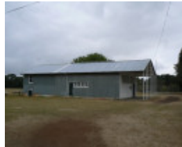
WOODHOUSE-NAREEB SOLDIERS MEMORIAL HALL COMPLEX 14442 P1050866