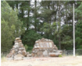
Memorial BUNDORAN LANE and CNR HAMILTON CHATSWORTH ROAD GLENTHOMPSON, 14442 P1050864