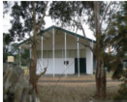
WOODHOUSE-NAREEB SOLDIERS MEMORIAL HALL 14442 P1050865