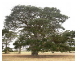
WOODHOUSE-NAREEB SOLDIERS MEMORIAL HALL tree 14442 P1050877