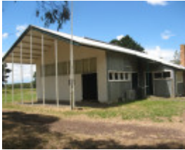
Woodhouse-Nareeb Soldiers Memorial Hall