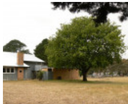
WOODHOUSE-NAREEB SOLDIERS MEMORIAL HALL 14442 P1050869