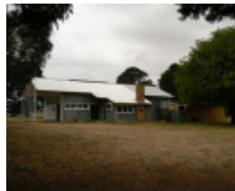
WOODHOUSE-NAREEB SOLDIERS MEMORIAL HALL 14442 P1050870