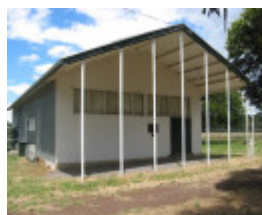
Woodhouse-Nareeb Soldiers Memorial Hall