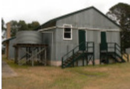
WOODHOUSE-NAREEB SOLDIERS MEMORIAL HALL 14442 P1050873