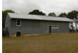
WOODHOUSE-NAREEB SOLDIERS MEMORIAL HALL 14442 P1050875