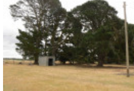
WOODHOUSE-NAREEB SOLDIERS MEMORIAL HALL 14442 P1050874