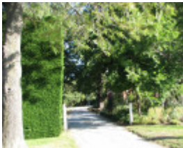
EDRINGTON SOHE 2008