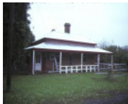
edrington berwick former homestead brick cottage