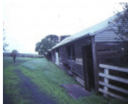
edrington berwick outbuildings apr1985