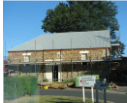
EDRINGTON SOHE 2008