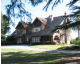
EDRINGTON SOHE 2008