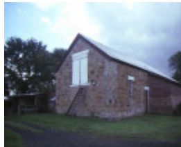
edrington berwick barn apr1985