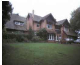
1 edrington berwick front view of house apr1985