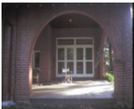
edrington berwick brick arch of house apr1985