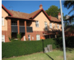
EDRINGTON SOHE 2008