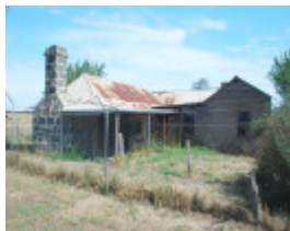
JOHN KELLY'S FORMER HOUSE SOHE 2008