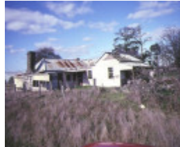
john kelly's former house whiteside street beveridge site view