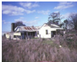
john kelly's former house whiteside street beveridge site view