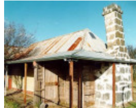
john kelly's former house whiteside street beveridge chimney 2