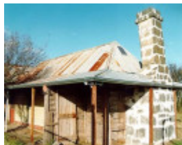
john kelly's former house whiteside street beveridge chimney 2