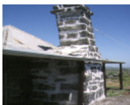
john kelly's former house whiteside street beveridge restored chimney nov1993