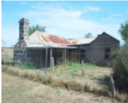
JOHN KELLY'S FORMER HOUSE SOHE 2008