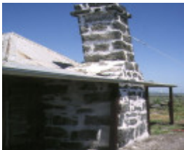
john kelly's former house whiteside street beveridge restored chimney nov1993